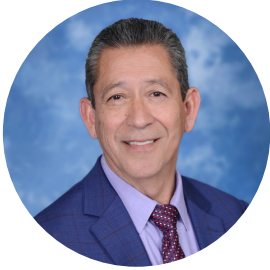
MAYOR Al Rios