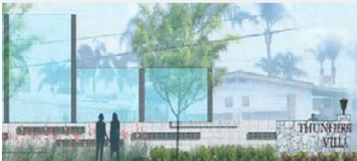
I-710 FWY SOUNDWALL $8.9M