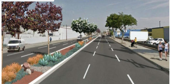
IMPERIAL HWY & GARFIELD AVENUE STREET IMPROVEMENTS $4.9M