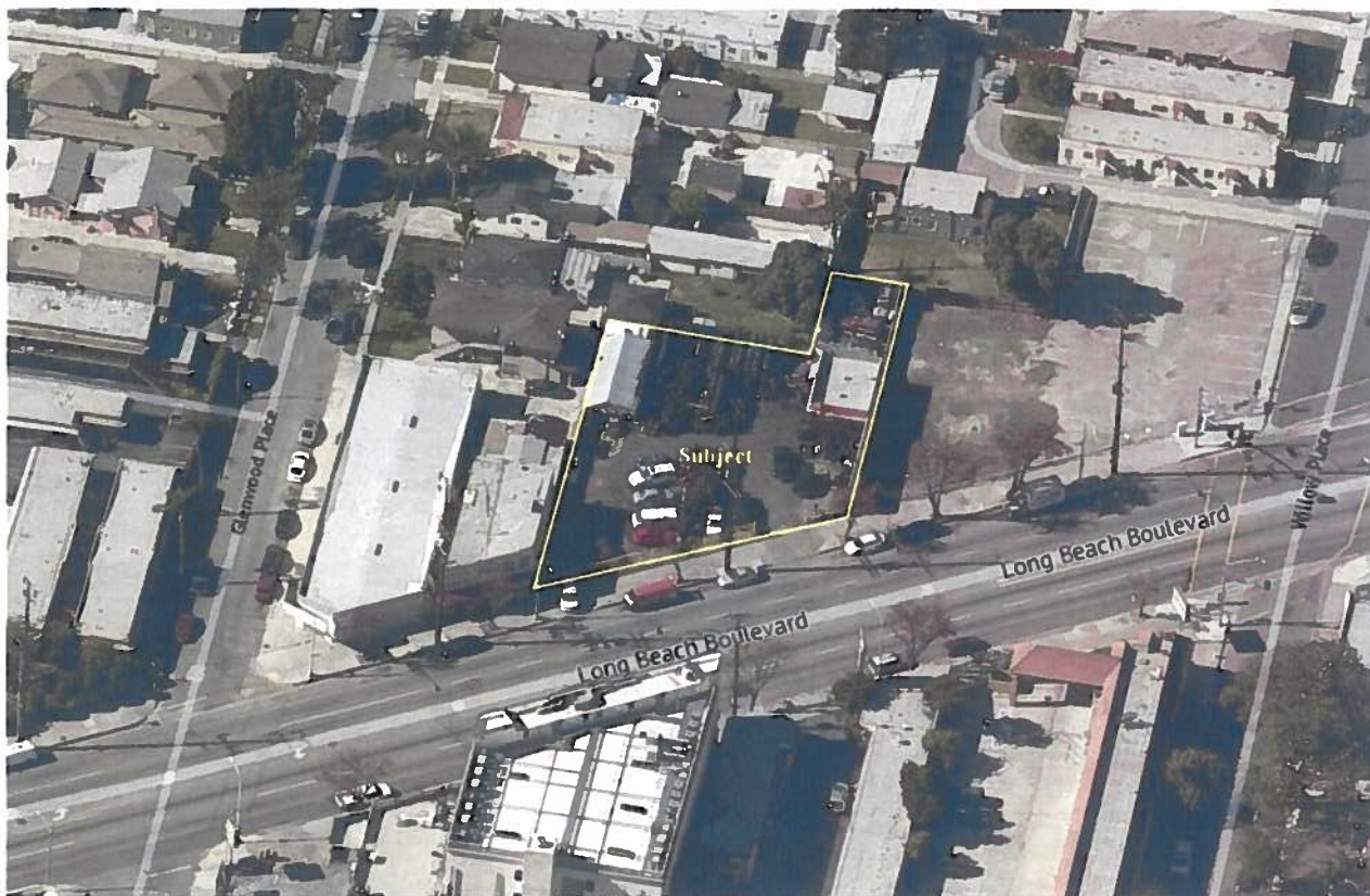
Figure 1: Subject Property Map (9019 Long Beach Boulevard). To the north (immediate right, to Willow Place), the Housing Authority owns the two vacant lots at 9015 and 9001 Long Beach Boulevard.

The Housing Authority entered into an exclusive negotiating agreement (“ENA”) on April 23, 2019 with Habitat for Humanity. Due to a small change in the development program, staff and special counsel are working on an amended proposed exclusive negotiating agreement (“Amended ENA”) that will be brought to the Housing Authority for consideration in November 2019. The Housing Authority intends to execute an Amended ENA stating the developer would fund up to $75,000 for remediation work. In the meantime, this proposed acquisition is an opportunity for the Housing Authority to assemble more land at this location, thereby enhancing the feasibility of affordable housing development at the site, especially given the lack of available larger lots in the community.